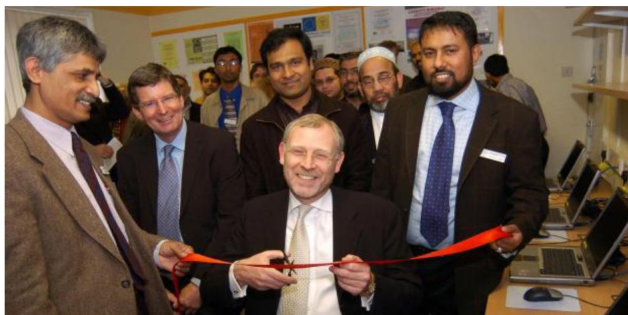
The opening of Tower Street in 1998

BSCMS chair awarded honorary doctorate by University of Suffolk Equity champion award from NHS Suffolk