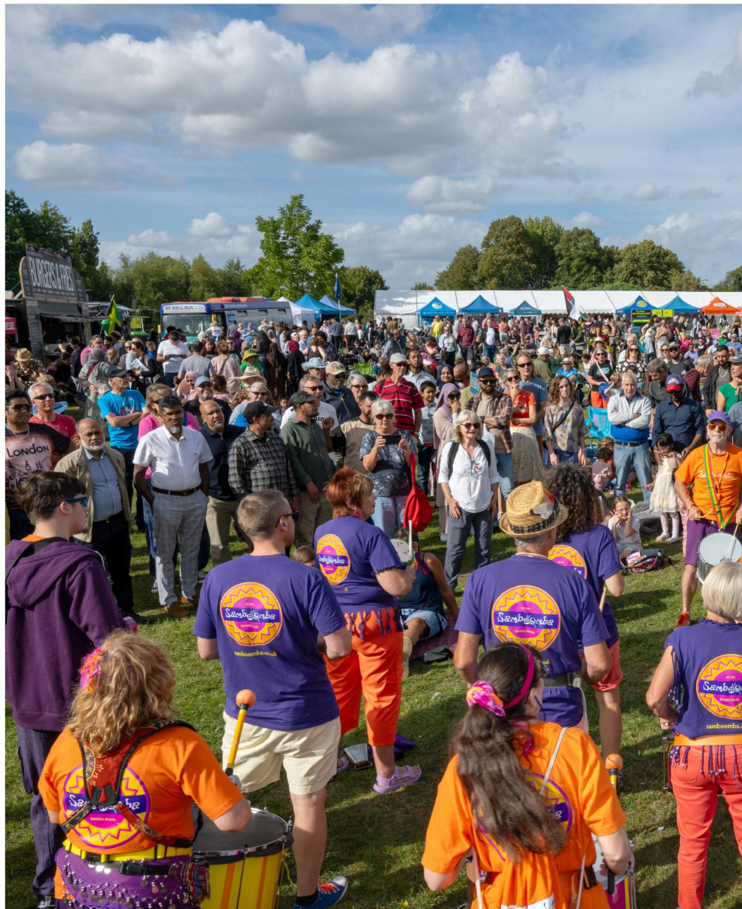
Large crowds gathered in Alexandra Park, Ipswich, for the return of the Big Multicultural Festival

"Cultural diversity has been reflected in BSCMS's work over the last 27 years, and this festival is a prime example of their contribution to promoting diversity through food, sports and music.